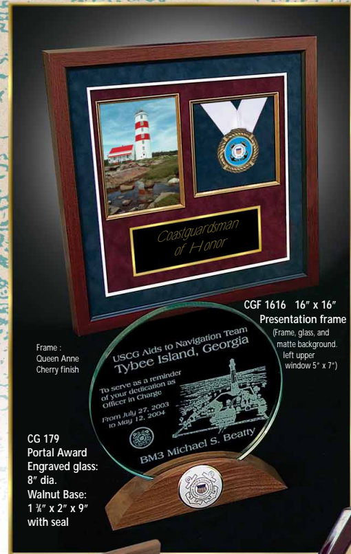
CGF 1616 16" x 16" Presentation frame (Frame, glass, and matte background, left upper window 5" x 7")