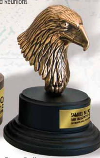
CG 655 6 1/2" ht Base: 5" dia Bronze Finish Metal Casting