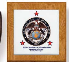
CG 88 8" x 8" Ceramic Tile Plaque Simulated oak finish