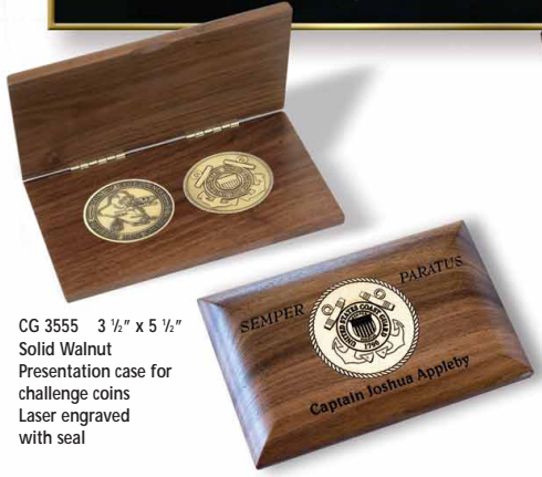
CG 3555 3 1/2" x 5 1/2" Solid Walnut Presentation case for challenge coins Laser engraved with seal