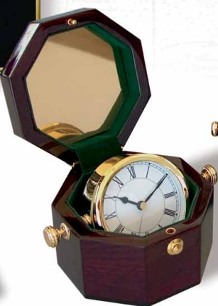
CG 1553 5 1/2" x 5 1/2" x 3 1/2" Captain's Clock - octagonal (Engravable on or in lid)