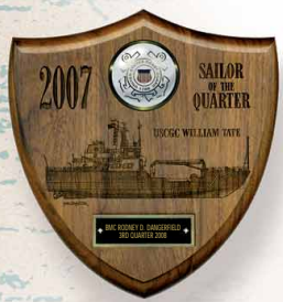
CG 100 7 1/4" x 8" ht Solid walnut - Laser engraved / w color seal