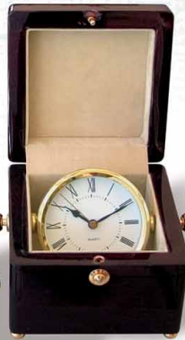
CG 1554 5 1/2" x 5 1/2" x 3 1/2" Captain's Clock - square (Engravable on or in lid)