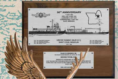
CG 1012 10" x 12" Commissioning / De-Commissioning and Reunions