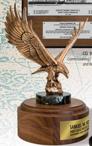
CG 127 Walnut Base: 12" ht x 7" dia Bronze Finish Metal Casting