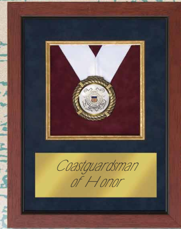
CGF 1013 10" x 13" Presentation frame for any recognition occasion (Frame, glass and matted suede background)