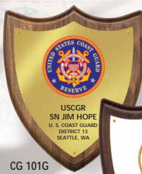
CG 101G Walnut light 7" w x 8" ht Gold plate